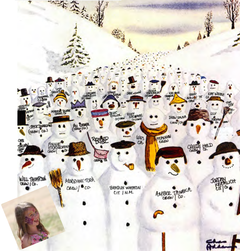
The ingenious Charles Addams serves as inspiration to announce those Geneva Glen campers who will be turning into staff members this summer! These "snow-people" are wearing their names, job title, and state from where they will be marching to camp!

We delight in the blessings of a full camp with a healthy return of veteran leaders to guide you in the fun. Be sure and notice the snowman illustration which lists those who were former campers (twenty-eight of them!), who are returning to be on the camp staff for the very first time. And campers, check out the Orchestra, which includes all of your favorite counselors that will performing for this fantastic summer of "Harmony" – our ninety-second season!